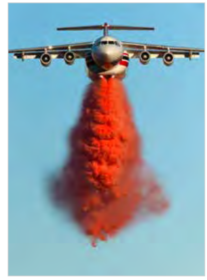
Special Mission Aircraft like the RJ85 aerial firefighting tanker is a key example of the capabilities that companies like BC's Conair can offer to the world.

Aviation Training - BC's unique aviation history and geography has, over time, created strong capabilities, facilities, and know-how in training. Significant demand from Asia is evolving for aviation training - China, in particular, is a large market that BC is well positioned to serve.