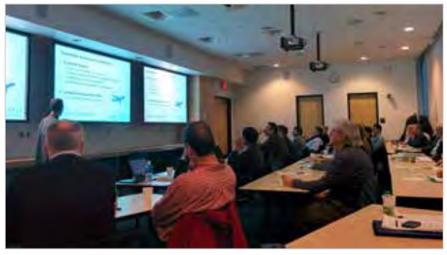
Since the launch of the Consortium for Aerospace Research and Innovation in Canada (CARIC) in April 2014, CARIC R&D information workshops have been held at ADSE, in Richmond (pictured above), Kelowna and Victoria.

Because BC trails other Canadian provinces in aerospace R&D investment, improving BC aerospace R&D capabilities and capturing a greater share of federal research dollars were specific objectives of the provincial first-year agreement. To help stimulate aerospace R&D activity and deliver federal funding support to BC, AIAC Pacific signed on in March 2015 as CARIC's regional office for BC and Alberta - one of