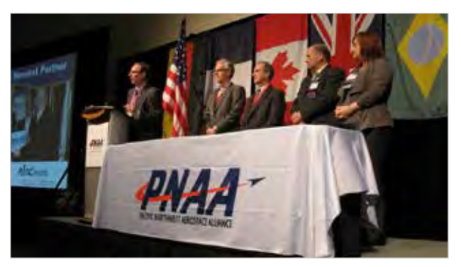
Hands across the border – AIAC Pacific signed a reciprocal membership agreement with PNAA during its annual conference in Lynnwood, Washington in February 2015.

At the Pacific Northwest Aerospace Alliance annual conference in Lynnwood, Washington, AIAC Pacific seized an opportunity to formalize and strengthen its relationship with PNAA whose core membership resides in the largest aerospace cluster in the world next door in Washington State. The signing of a reciprocal membership agreement between AIAC Pacific and PNAA was featured prominently on the conference program and represented a significant step for AIAC Pacific in offering the BC industry a voice at the regional, national and international levels.