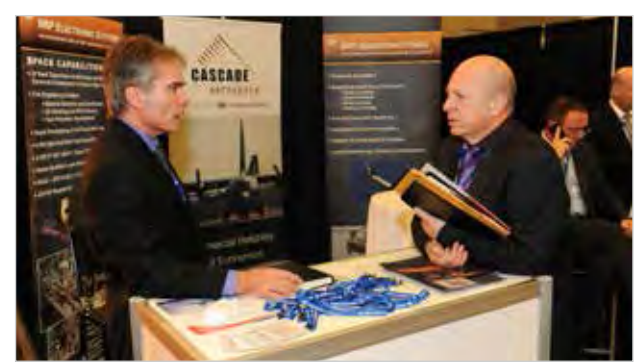
National and international conferences and trades shows - like the 2015 PNAA conference (left) and the 2014 Canadian Aerospace Summit (right) – offer valuable opportunities for BC aerospace firms to connect with Canadian and global OEMs and suppliers. BC was well represented at both events, with 25 companies participating in PNAA and another 25 attending the Summit.

The goal of these missions was to create a platform for BC and other western companies to make connections and pursue business opportunities. Through these missions, participating BC firms made valuable contacts by attending hundreds of meetings with Canadian and international OEMS and suppliers, with trade representatives, elected and non-elected government officials - and with each other.